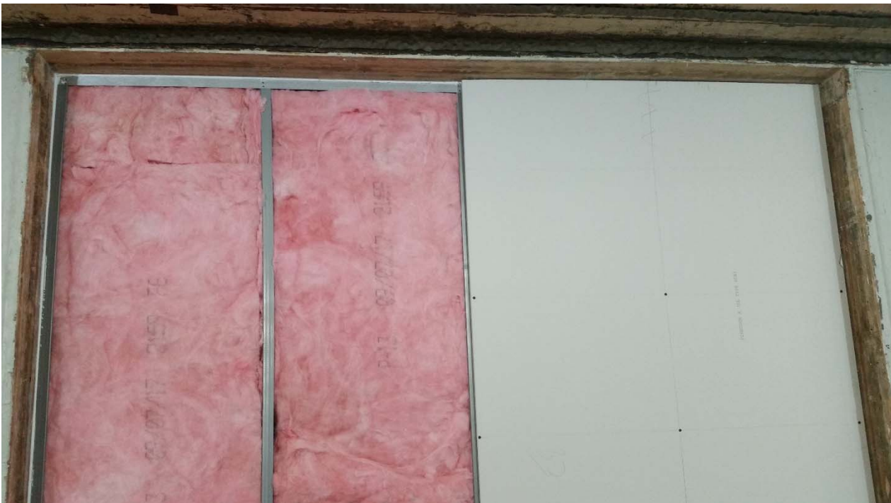
Figure 4 – Stud cavity insulation installed, receive side gypsum board partially installed