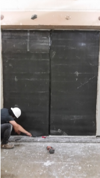
Figure 3 – Mass-loaded vinyl layer installed