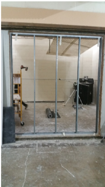
Figure 2 – Framing members installed