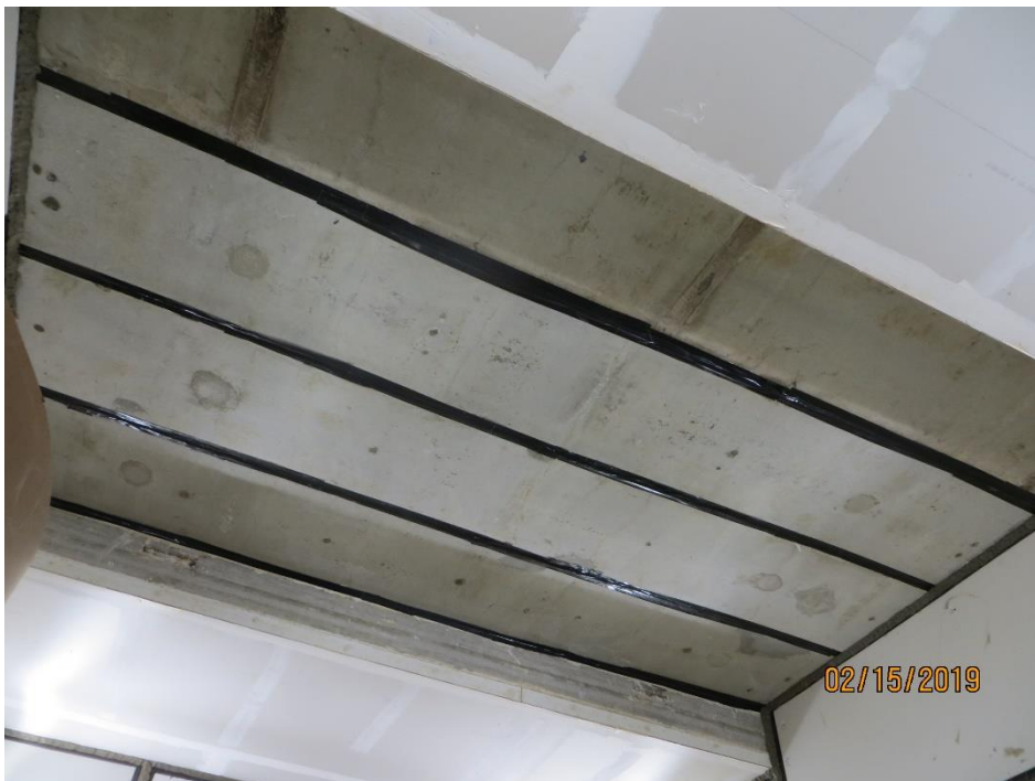
Figure 2 – Completed specimen mounted in test aperture, as viewed from receive room.