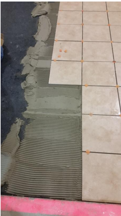
Figure 6 – Mortar and tile partially installed over underlayment