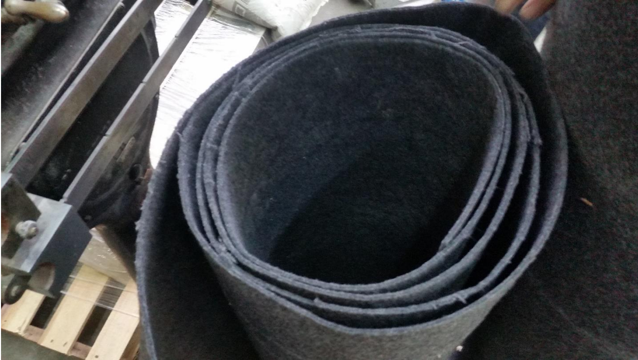
Figure 5 – Detail of underlayment material