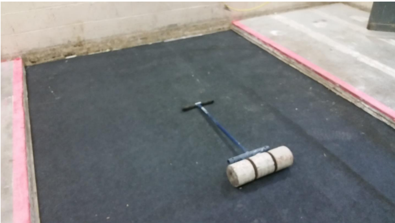
Figure 4 – Underlayment installed, floor roller used in installation