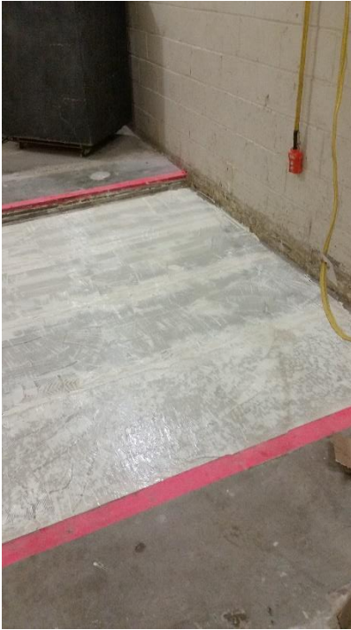
Figure 3 – Adhesive installed on polyethylene sheet over concrete slab