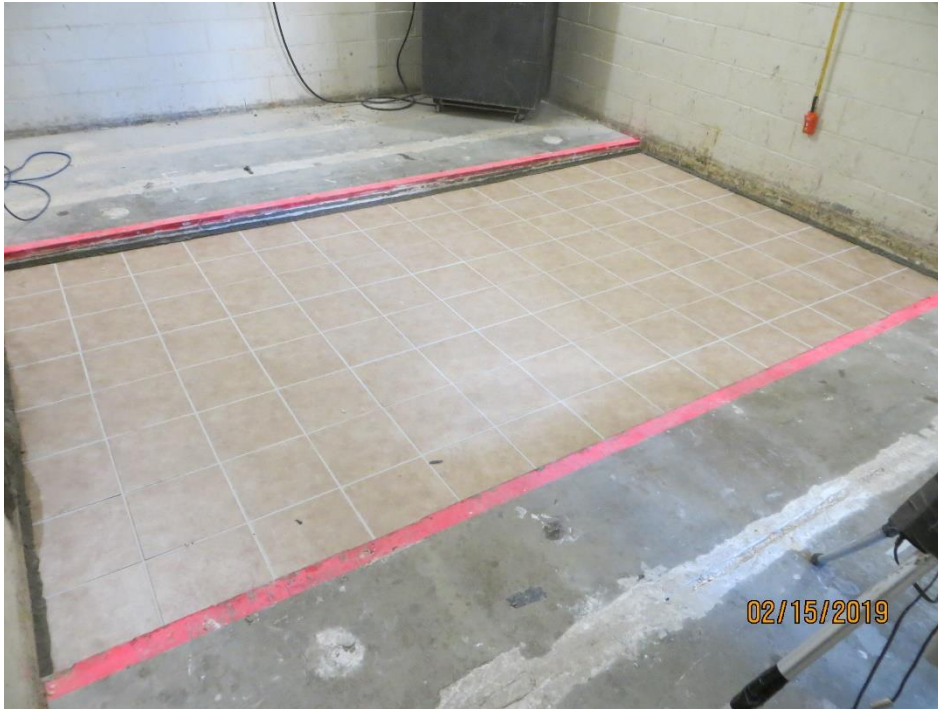
Figure 1 – Completed specimen mounted in test aperture, as viewed from source room.